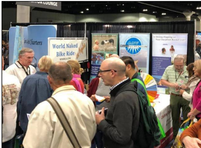
The very busy AANR-West booth at the LA Travel and Adventure Show.